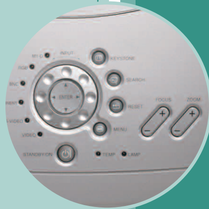
Multi Function Controls