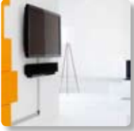
Hide the cables. SMS Cable Management.

Accessories: SMS Cable Management (Page 6:01).