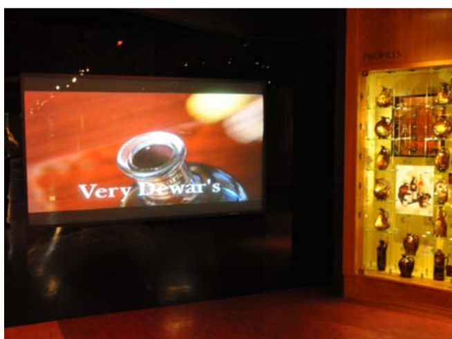
StarGlas rear projection screen being used in the Dewar's visitor's centre.

Available in single sheet sizes up to 3.2 x 6.1 meters, the StarGlas screen installed at Dewars measures in at 2 x 4 meters. This screen size was recommended as the best option to maximize the screen space available at the distillery. The screen itself is formulated to offer unsurpassed contrast levels, giving the Dewar's visitors high-quality viewing pleasure.